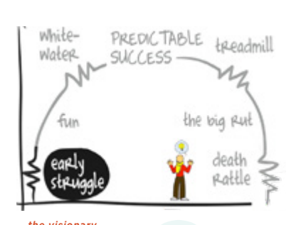
leadership style within the first stage of the lifecycle

The first stage of nearly every enterprise is a period of time known as Early Struggle. For an operating business, it is the period when a profitable and sustainable market is being identified. Unfortunately for most businesses, it is a race against time.